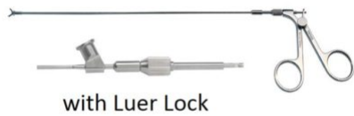
with Luer Lock