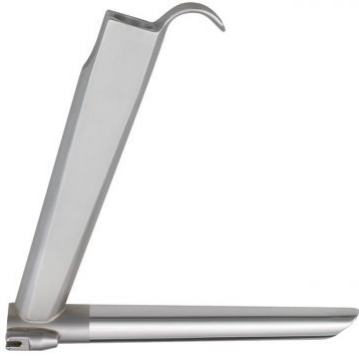
fig. 7; Ø 13x18mm; 222mm